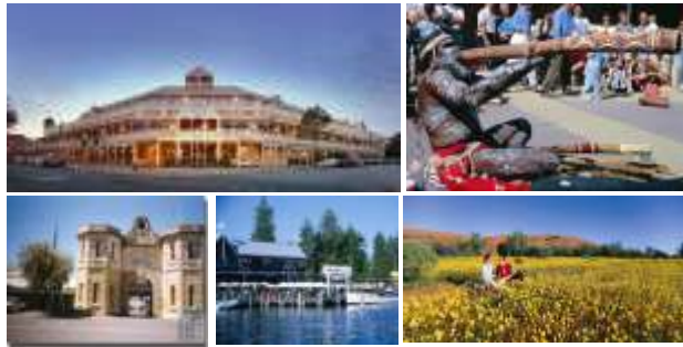
L-R Esplanade Hotel, Fremantle Markets, Fremantle Prison and Harbour and spectacular WA Wildflowers